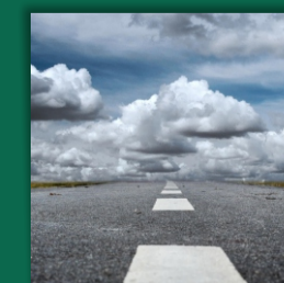
ELEVATED BLACK TOP ROADS