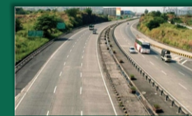
Chennai to Bangalore Highway