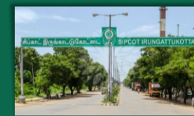
SIPCOT Industrial Estate