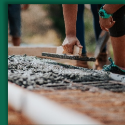
READY FOR CONSTRUCTION