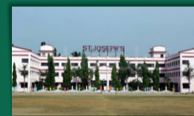
St.Joseph's Residential School