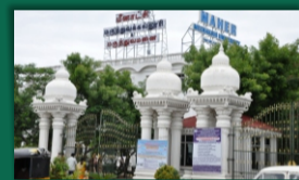
Meenakshi Medical College & Hospital