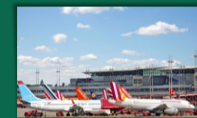
Proposed Green Field Airport